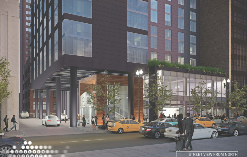
STREET VIEW FROM NORTH